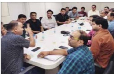
बैठक में शामिल पूर्व छात्र।