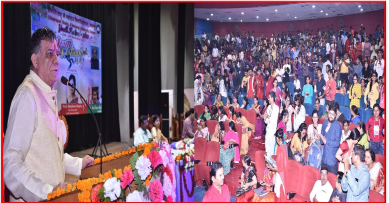
YOUTH FEST ON 08.05.2018