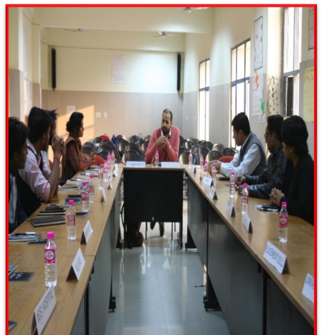
SESSION ON MOCK INTERVIEW AND GROUP DISCUSSION IN APRIL 2019